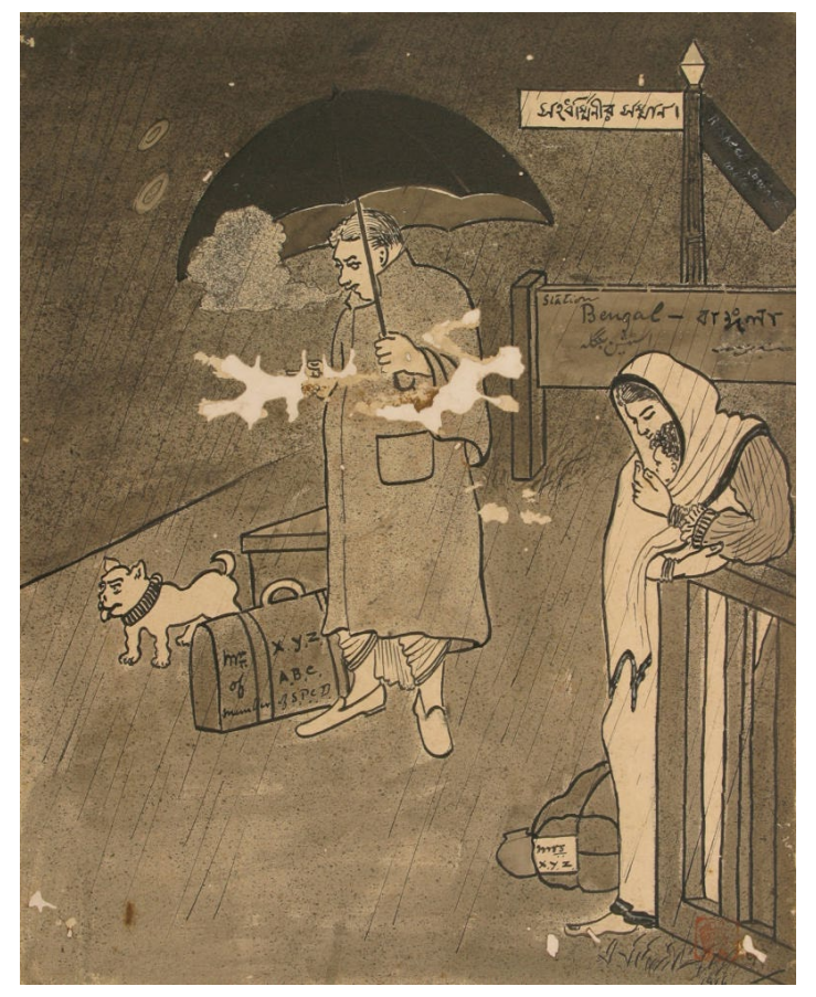
Figure 2. Tagore, Gaganendranath. «Respect Towards Wife in Bengal». Kolkata: Victoria Memorial Hall, 1916.

Another 1916 sketch (Fig. 2), also set on a railway platform, features a Bengali gentleman in European attire, casually smoking a cigarette as he hogs the umbrella in pouring rain. His wife stands quietly in one corner, covering a small child with her sari even as she is drenched in the process. The railway station signboard on top reads: «Sahadharmini'r Samman/Respect for a Wife», while another signboard names the railway station as «Bengal/Bangla» .