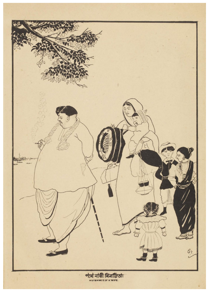
Figura 3. Tagore, Gaganendranath. «Nuisance of a Wife». London: Victoria and Albert Museum, 1917.

Yet another black-and-white sketch, from 1917 (Fig. 3), features a gentleman dressed in fashionable dhoti-kurta , a walking stick on one hand and a cigar on the other. He ambles along, seemingly unconcerned as his wife