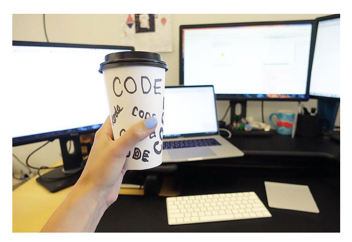
Figure 2. Snapshot from Laura Medalia's blog

Other personal blogs in the sample also contain statements, reflections and sentiments for the rest of the world to see and sometimes are a medium for the presentation of the self. A case in point is Girls in Tech , composed of different testimonies of women working in engineering topics (figure 3).