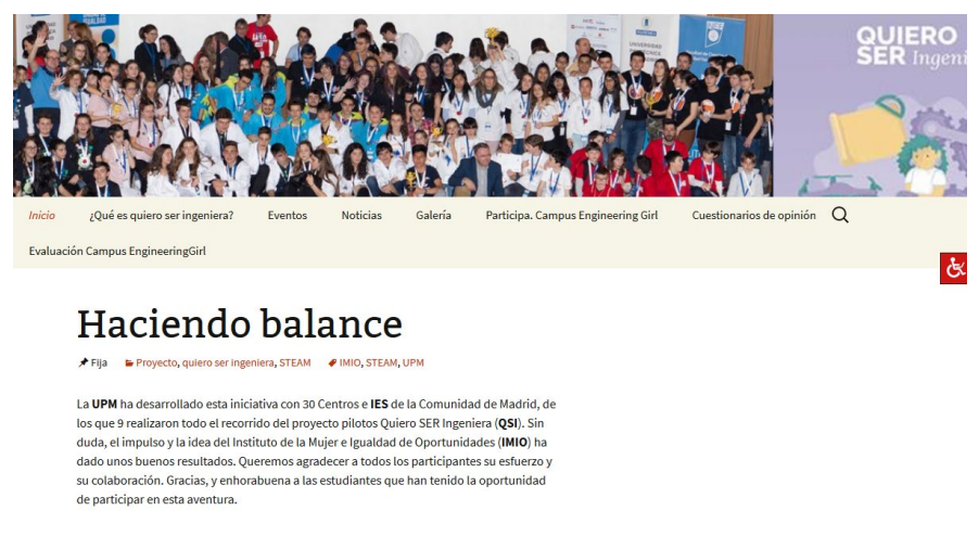
Figure 4. I want to be a female engineer . Institutional Blog sponsored by the Technical University of Madrid.

organization of verbal and visual elements on the page runs on a diagonal axis, from the left top corner towards the right bottom. Social network icons are placed there.